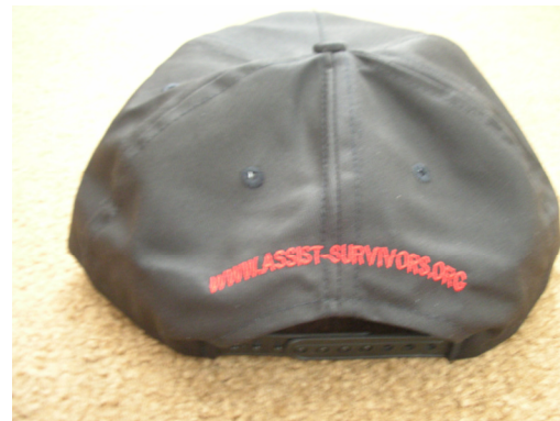
ASSIST Hat Adjustable $10.00