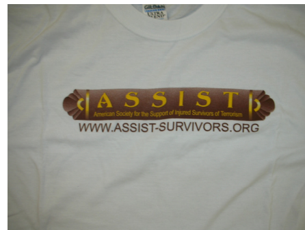
ASSIST T-Shirt $10.00 L and XL Based on Availability of Size