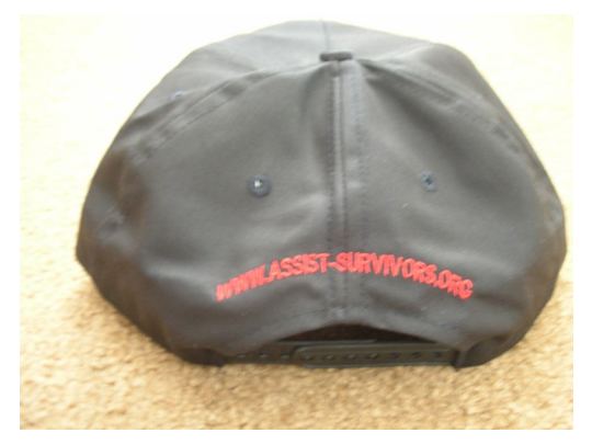
ASSIST Hat Adjustable $10.00