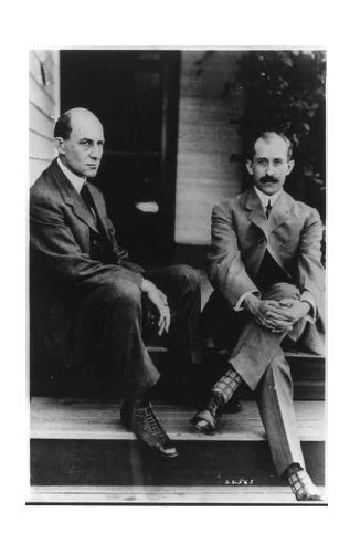
The Wright Brothers

ness and went into a growing national activity, cycling. The same year they began repairing and building bicycles.