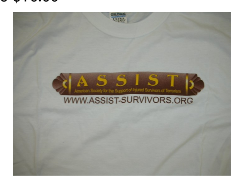
ASSIST T-Shirt $10.00 L and XL Based on Availability of Size